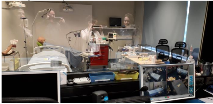
This day also marks my first lecture in the auditoriums of Tallinn Health Care College. The students were friendly and asked lots of questions. They were very curious about Vlora and Albania as they had almost no information at all.

On the first day of mobility we were received by the head of the international office who welcomed and introduced us to the colleagues who would accompany us during the mobility. We also had a meeting about cooperation, visiting the simulation center and attending some classes in this center. The simulation center was very impressive. An improvised mini-hospital on the premises of a school where students and ambulances improvised accident scenes that required immediate medical intervention and where the integration of high technology enabled 3D learning for many modules.